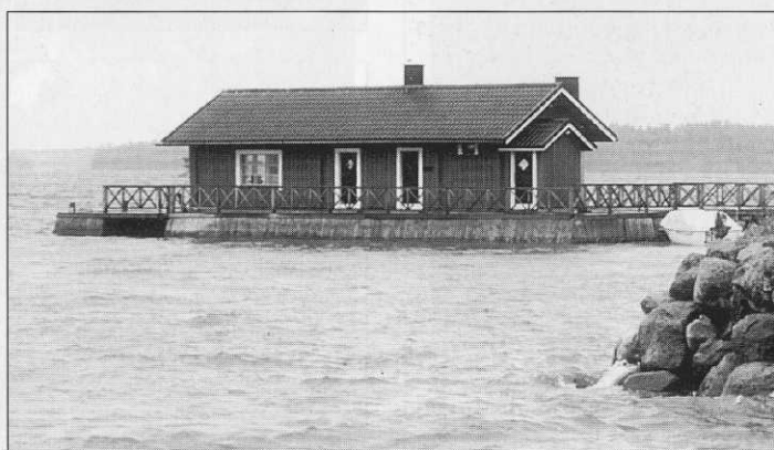
A Finnish sauna backs on to the sea

Next month we will examine the research work carried out by the Finnish greenkeepers and the Finnish Golf Union and take a look at the state of the art Mechanic's workshop in Katinkulta.