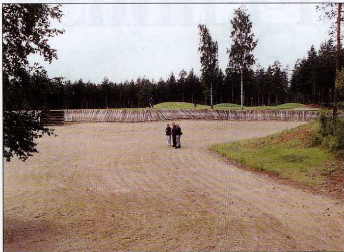
An extra large bunker at Vierumaki Golf