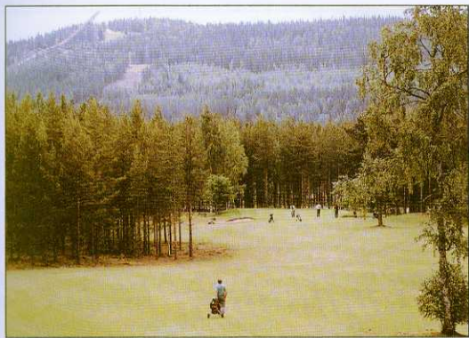
The course - complete with ski jump on the horizon