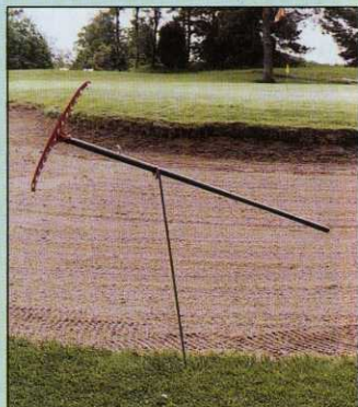
Novel way of dealing with rakes at

The practice course also doubles as a testing station for new