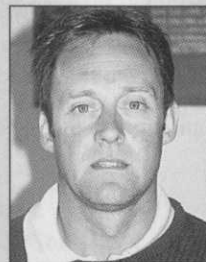
"Be in the pub"