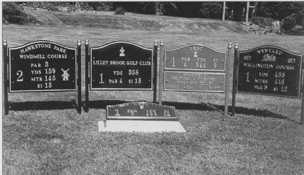
The Links Leisure course markers can be produced in either a standard or tailor-made range of styles and designs

use. Several stock ink colours are available, or you can specify any Pantone (PMS) colour.