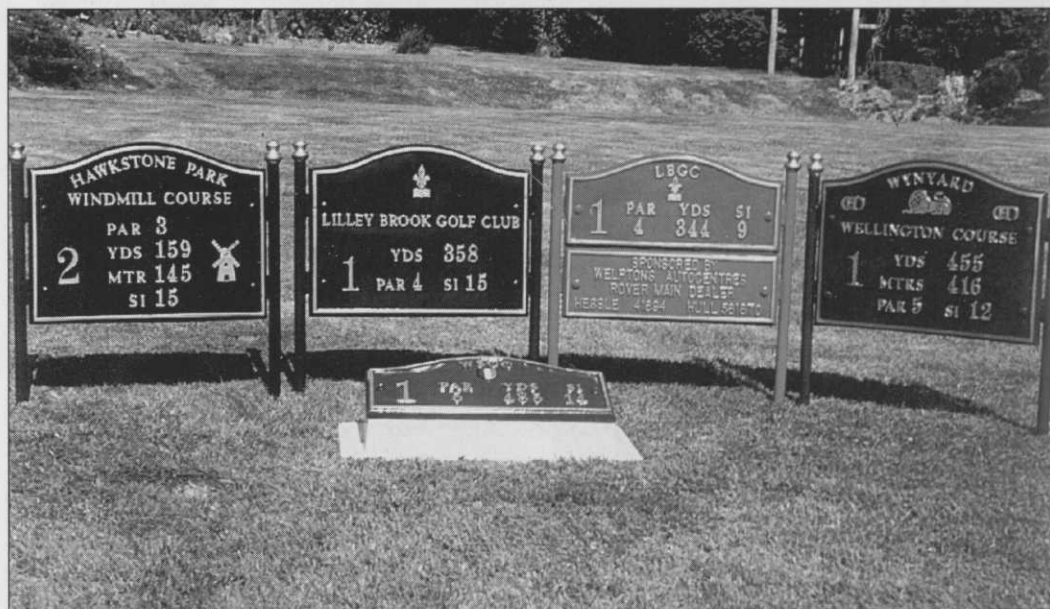
The Links Leisure course markers can be produced in either a standard or tailor-made range of styles and designs

use. Several stock ink colours are available, or you can specify any Pantone (PMS) colour.