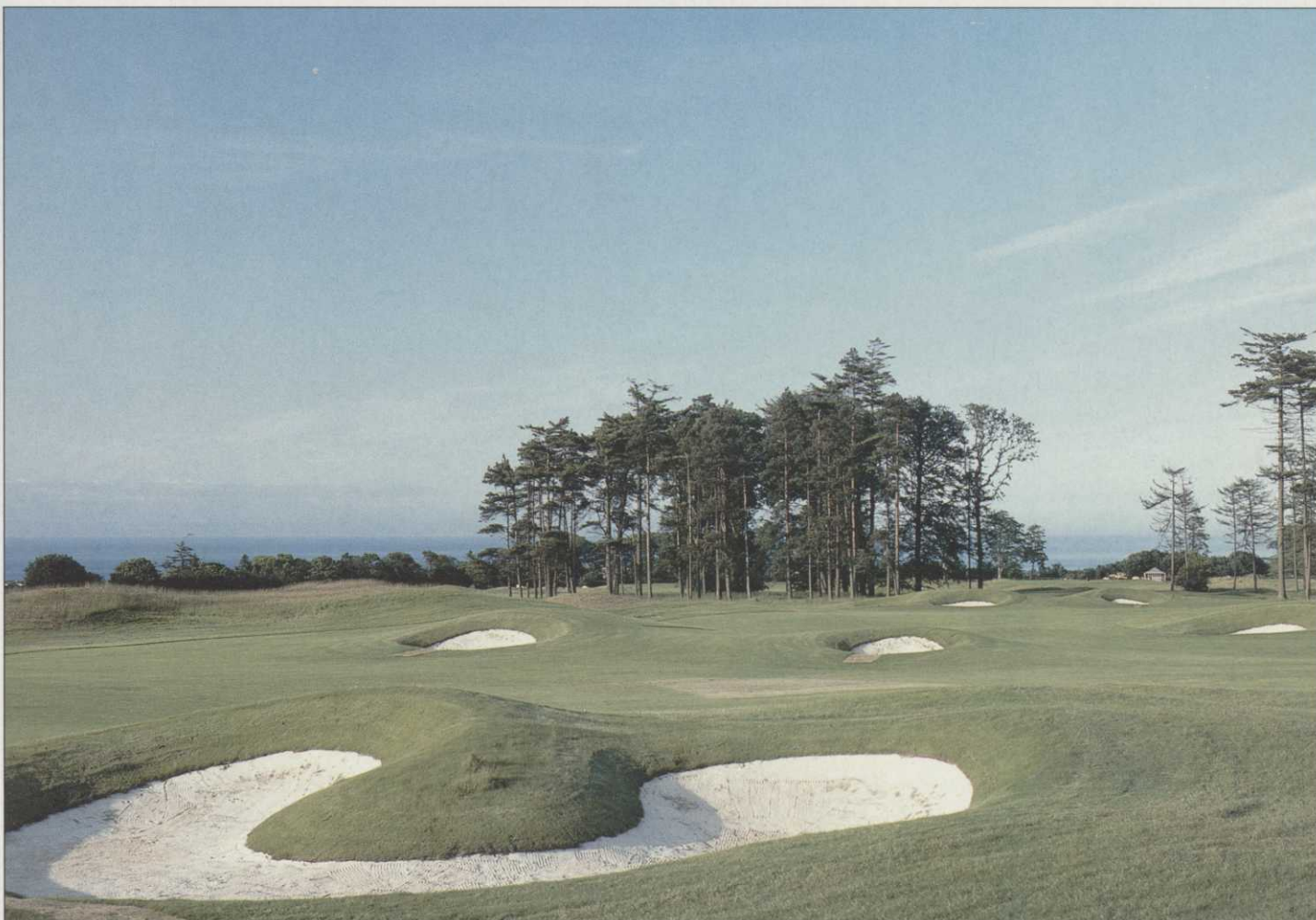
Above, the 13th at The Duke's Course and below, the 18th