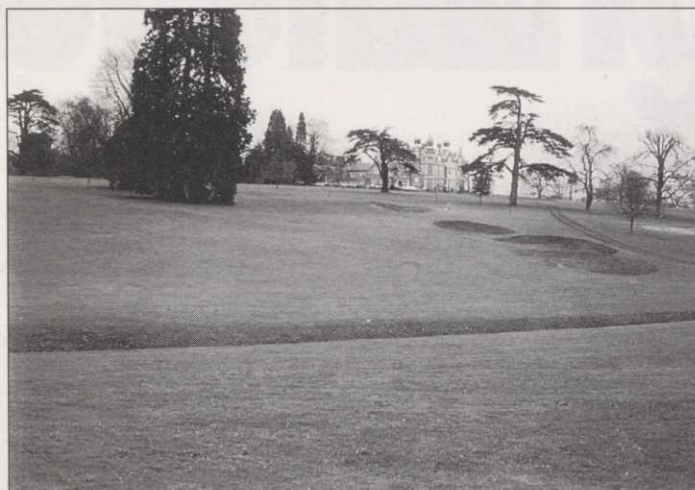
The 17th with three new bunkers guarding the right side of the fairway