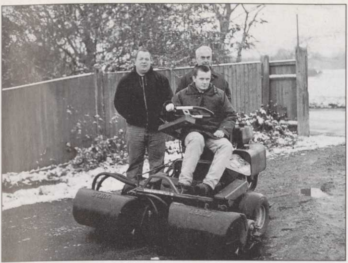
The Wimbledon Common Golf Club's team and their Toro 3200-D

a lot of money on it a season or two ago, it was considered worth retaining. No pedestrian mowing is undertaken and greens are cut daily.