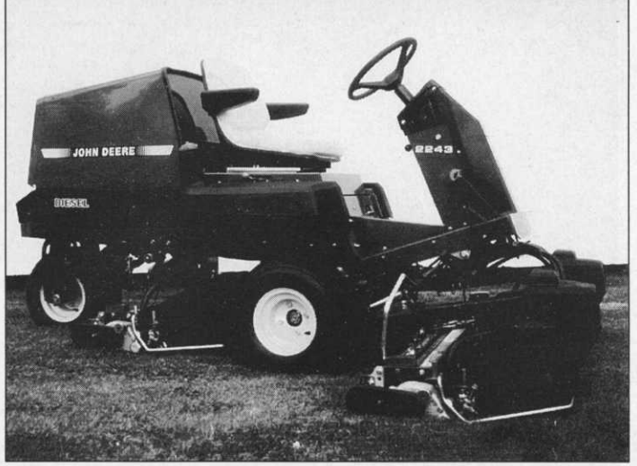
John Deere 2243