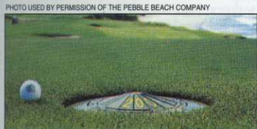
The Original Green Kirby Marker