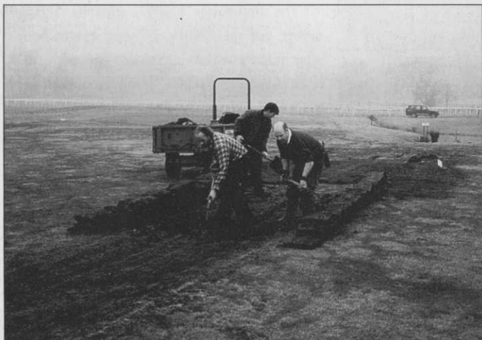
Hard at work removing turf

Our watering is from a bore hole. We handwater but hopefully if we make enough money I'll have a water system within the next couple of years. We've got water beside each of the greens and we lay out hoses and manual sprinklers.