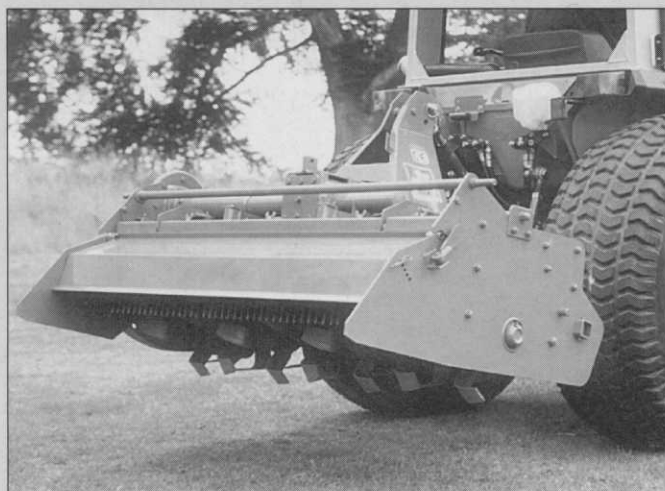
The new Amazone Stone Burier has a 'screen' of bars which catch stones and trash, dropping them to the ground where they are covered by the topsoil which passes through the screen

WinWater, running in Windows, is very simple to use and requires little or no computer skills to operate it. A boon to greenkeepers, changing from time-consuming, conventional, fiddly controllers to the new "on-screen" set-up is straightforward and quick; familiarisation takes only a short time and setting up an irrigation programme is carried out by simply