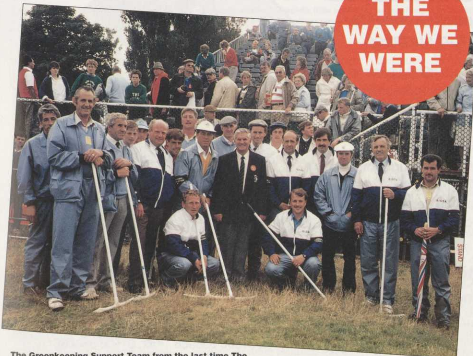
The Greenkeeping Support Team from the last time The Open was held at Lytham – eight years ago