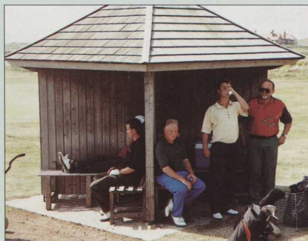
One of the St Annes Old Links watering holes