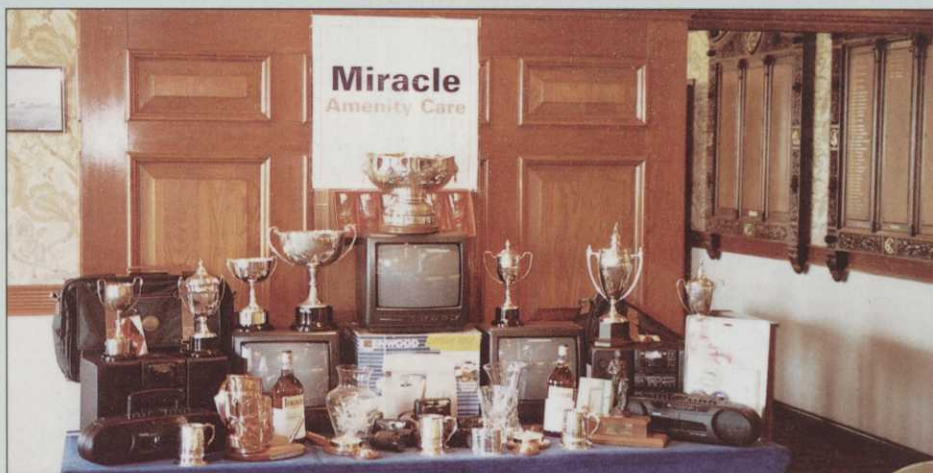
The overladen prize table

Annes Old Links, teed off early during the tournament to fit in their regular games.