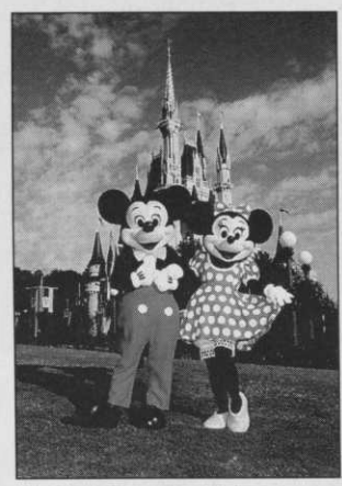
The trip to Orlando will also give you the chance to see the sights: but there's nothing Mickey Mouse about the GCSAA show – it's the

Transfer to the Orlando International Airport for the direct flight at 19.10 arriving at London Gatwick at 08.15am on Wednesday, February 14.