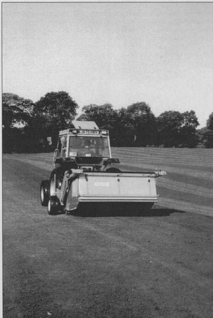
The Sisis Fibagroom

The capacity of the hopper at 4.5m 3 is large, and because the fan mulches the input it does hold a considerable amount of material. This has to be considered when tipping as the hopper hinges at the rear back, this makes it essential to only empty when the machine is stood on