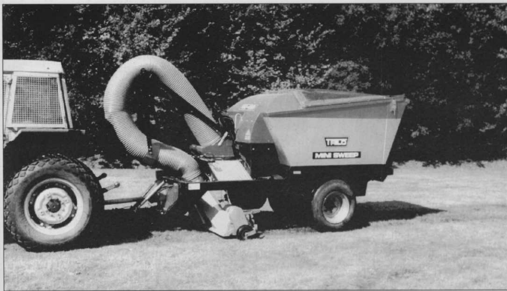
The Trilo Mini Sweep