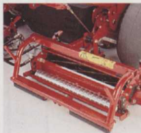
The new cutting system

An operator's dream, this new model is the latest in Toro's top-selling Greensmaster 3000 series. Its unique new cutting system gives a superb quality of cut.