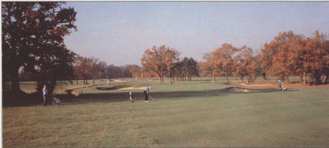
The 3rd hole at Ifield Golf and Country Club