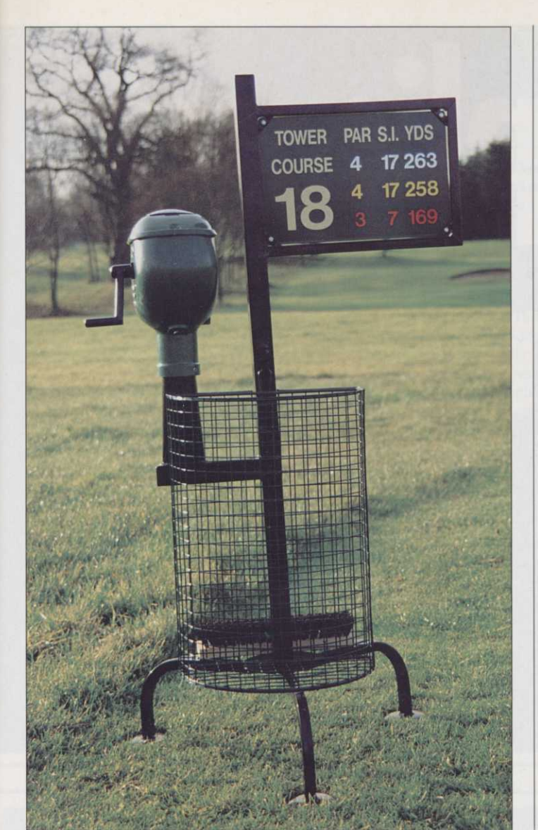
Talking point: a Pattisson's tee console, complete with ball washer

■ Pattisson's are acknowledged to be a one-stop shop for all course furnishings. From the tee area, Pattisson's range starts with the simple placement markers to their popular resin pear shaped and golf ball tee markers.