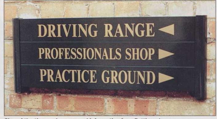
Sign of the times: elegance and information from Pattisson's

Even the humble boot cleaner comes in an updated version: ask for the Pattisson catalogue on 01582 597262 and check out the "electronic boot wiper".