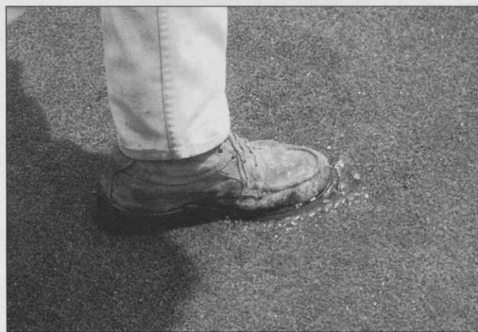
Too much water will cause problems in every aspect of turf management, as well as golf course playability. Proper water management involves both irrigation and drainage

The growing popularity of the game of golf has left many courses packed with players. This has made it more difficult to perform routine maintenance work, especially when it comes to making chemical applications. Some are limited to spraying on Monday mornings, while others have decided to spray at night. When a golf course superintendent knows