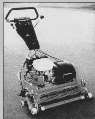
The new 422 Greens King pedestrian mower from Jacobsen complies with the latest EC regulations and is fitted with Operator Presence Controls (OPC). It also has a 22in cutting width and a high-speed 11-knife cutting cylinder. It is powered by a quiet 4hp, four-cycle OHV engine and, with its 11.5in rollerbase, follows contours without scalping. The reel, roller and traction drum are all the same width.

Standard Golf has also added a new "bigger, better" bunker rake to its range. The Tour Smooth Maintenance Rake is a maintenance class version of its Tour Smooth Bunker Rake. With its 22in wide, extruded aluminium head, heavy-duty teeth and extra-long, powder-coated aluminium handle (66 or 82in), the new rake is said to be "perfect for fin-