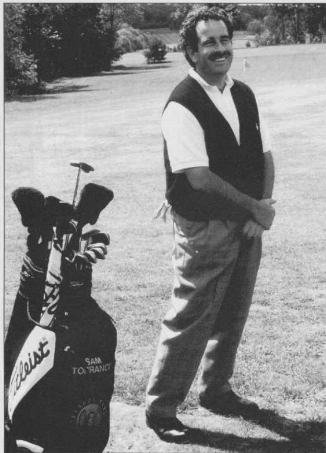
Selsdon Park Hotel in South Croydon is the home to the first Bob Torrance Golf Academy.