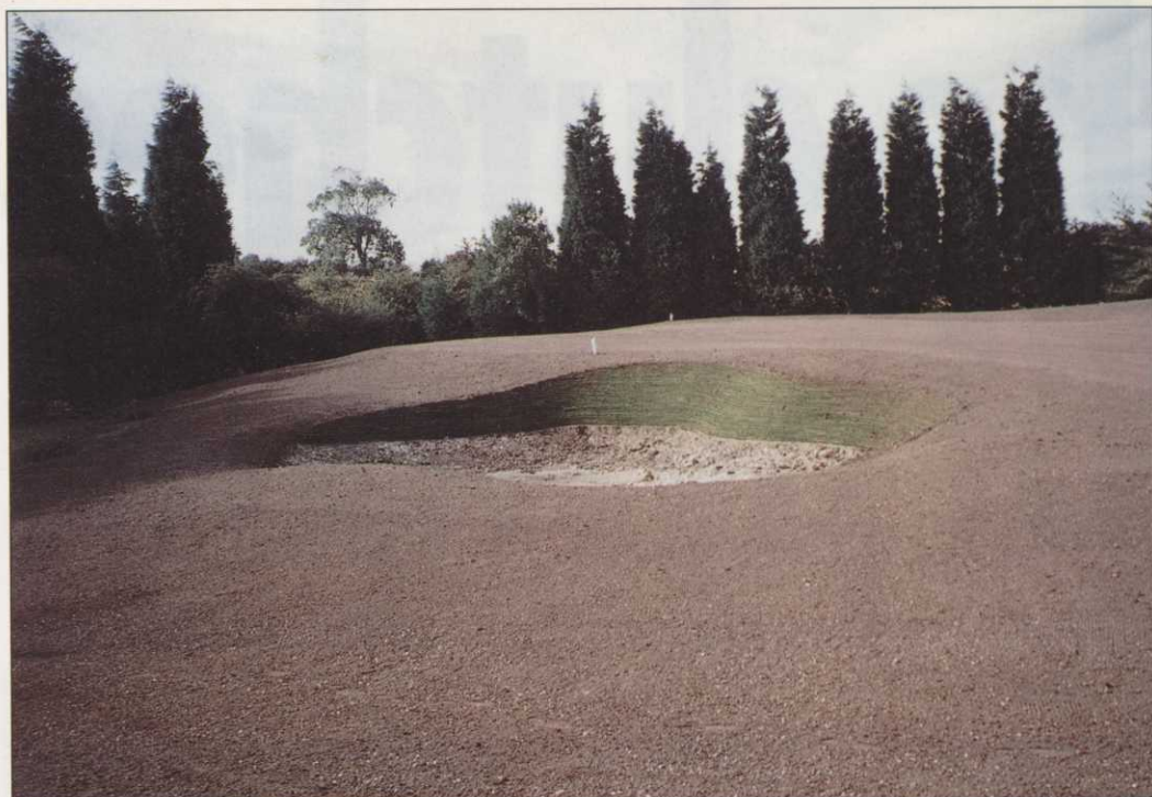
One of the re-designed greens and bunkers at Hesse