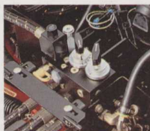
Variable speed and backlapping controls.

This greenkeeper knows he can rely on Toro's new dedicated tees mower to give a precision cut around bunkers, greens, tees, collars and approach areas. An excellent choice for intermediate roughs, tackling all