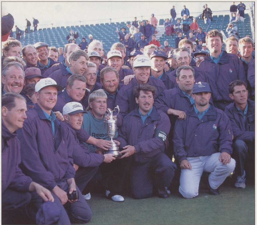
Moment of glory: the BIGGA Greenkeeping Support Team with this year's Open champion, John Daly