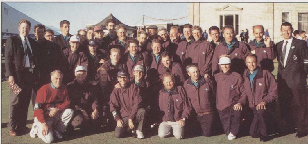
Team spirit: Members of the BIGGA Greenkeeping Support Team at St Andrews