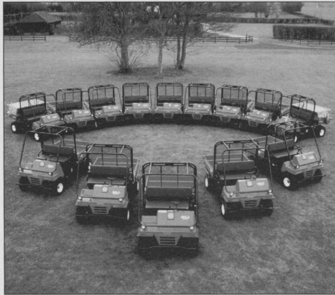
■ Never a club to do things by halves, Wisley has bought 14 Kawasaki Mule 2500s for carrying staff and equipment around the course. Two of the Mules, supplied by R Hunt of Stockbridge, are fitted with Amazon topdressers powered by hydraulic PTOs. These are pre-production versions of a hydraulic powerpack that Kawasaki plan to launch in the near future.