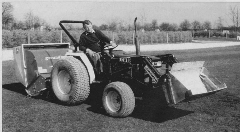
Roger Carpenter aboard his Ford 1520

With the loader and 4 in 1 bucket the tractor is an extremely versatile unit which is used for all manner of lifting,