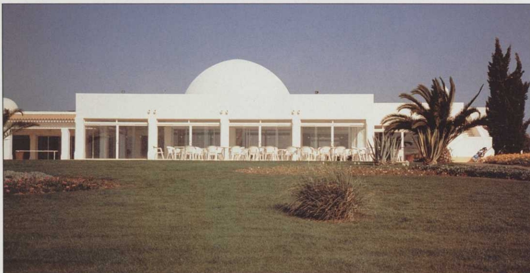
The clubhouse at Vilamoura III in the Algarve

"The cost of the green fee was about £3.80. Due to a relaxation of currency control, Royal Harare has now got a Toro greens machine. Needless to say, spares are a big problem. Another of the problems is that the kikuyu grass, which makes up most of the course, tends to creep onto the