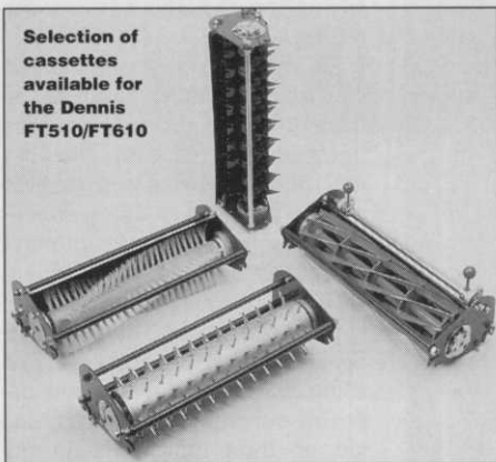
Selection of cassettes available for the Dennis FT510/FT610

Toro's leading greens mower, the Greensmaster 3100, is now available in a three-wheel drive model, the 3100-3WD. Toro sales manager David Cole told us: "The three-wheel drive feature allows operators to reach and mow very difficult areas where additional traction is required to get the job done, such as sloped or stepped greens or steeply elevated tees." He added that the Greensmaster 3100-3WD will especially benefit the many newer golf courses which frequently feature elevated greens or very hilly areas.