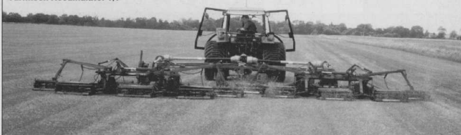
Turfmech Accumulator 7/7

Staffordshire company Turfmech Machinery Ltd has produced a frame that will enable one tractor to pull two seven-gang mowing units simultaneously. The Turfmech Accumulator 7/7 frame enables one man to mow 30ft (9.5m) in one pass. Turfmech tells us: "The Accumulator's frame geometry has been designed so that mowing performance both in a straight line and when turning at the end of a run remains at peak levels without risk of turf scuffing or the mowers interfering with an adjacent unit." To that end, all PTO drive shafts have wide angle joints to accommodate tight turns and both they and the unit's oversize gearboxes are rated to match the recommended tractor power input of 40-60hp required to tow and operate the 14 individual mowing gangs.