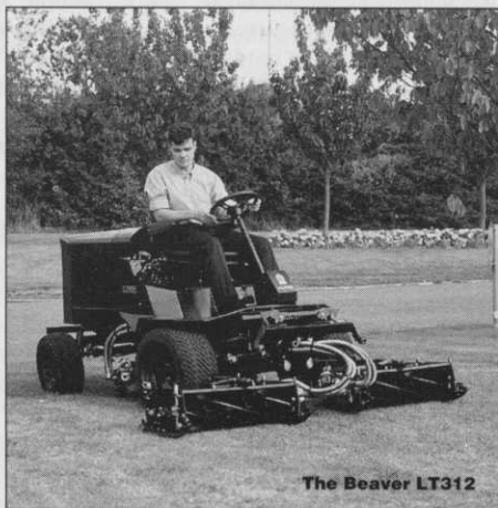
The Beaver LT312

The latest in the Condor line-up, the Condor Hydrostatic, was also on display. This mowing machine complies fully with all the latest CE specifications and boasts a Honda GX340 engine with an output of 11hp. The 36in (91cm) Rotary head featured on the display machine has dual rotating cutterheads, each fitted with cutterbars, variable height of cut and swivel castor wheels for extra manoeuvrability.