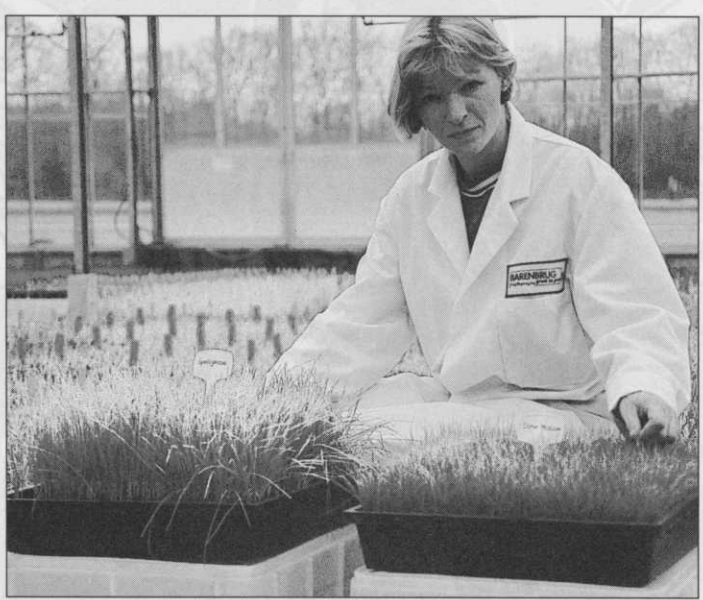
Quality varieties like Barkoel pay for themselves because they require less

The trouble is a cheap grass seed mixture leads to a bad sward, more maintenance (and