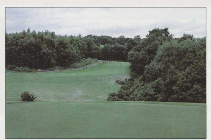
Higher quality varieties are needed to keep pace with quality requirements

top bent, the two most predominant grass types for golf courses.