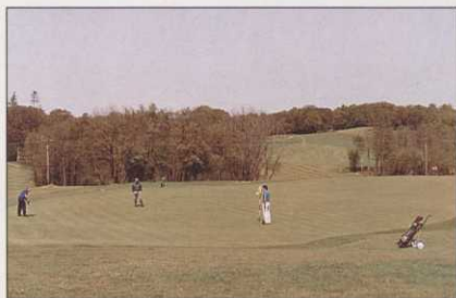
Hamptworth's double green – the 9th and 18th

Construction of a 6,500 sq ft clubhouse is planned for next year.