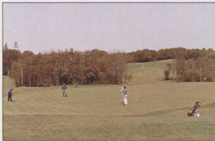
Hamptworth's double green – the 9th and 18th

Construction of a 6,500 sq ft clubhouse is planned for next year.