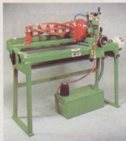
The new Juno 36" capacity Cylinder and Bottom Blade Grinder will accommodate every make and type of professional and domestic cutting cylinders and soleplates. Simple to operate, fast changeover from cylinder to bottom blade grinding.