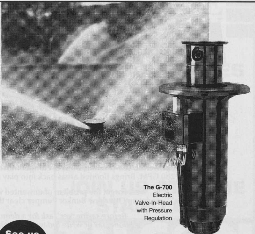
The G-700 Electric Valve-In-Head with Pressure Regulation