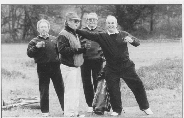
The most popular hole at Walton Heath during the South East Section's Annual Gentlemen's Dinner – the watering hole.

These 12 will represent the North Section in the Scottish Finals in May at Duddingston Golf Club.