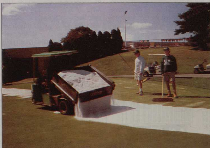
First step is to apply topdressing sand heavily only to the strip to be aerated

with these results, and with most course managers being sensitive to criticism, it is no wonder we see so many deep aeration operations being just that — the punching of holes into the greens without any attempt made to fill