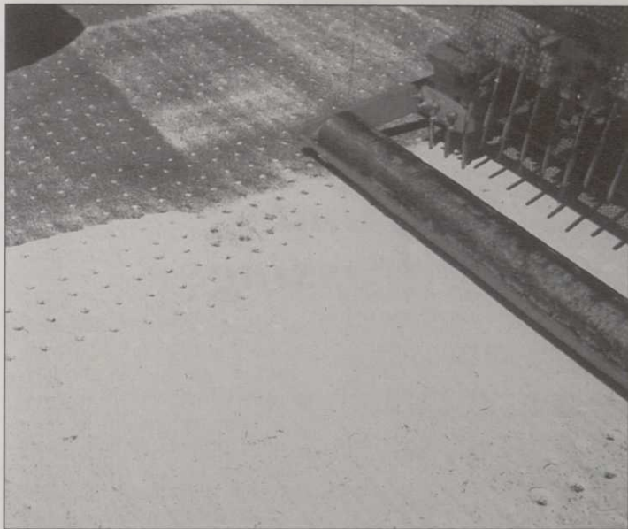
The sand begins to fill the holes by gravity or the 'hourglass' effect, even without brooming