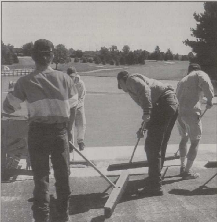
After the Verti-Drain has completed its pass, the crew hand-brooms the topdressing material into the holes. The back-and-forth action completely fills the holes with minimum damage to the turf

hole and, like an hourglass, the topdressing filters down into the hole and fills it up.