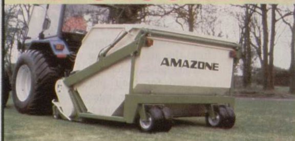
...Mows rough or fine.