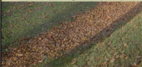
...Leaf and litter clearance - no problem!