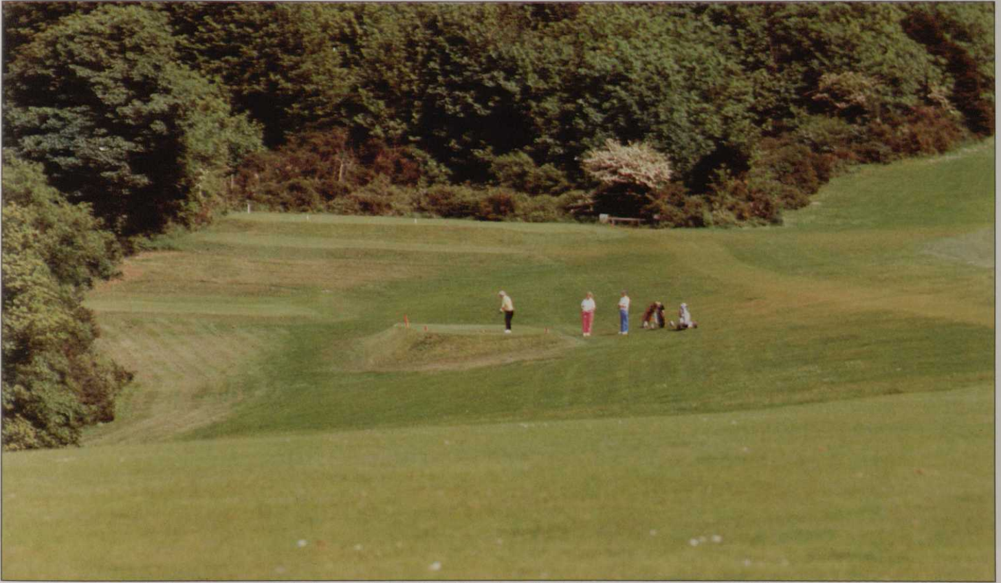
A completely new combined summer and winter tee has been built for the ladies on the 12th. The ladies former tee, on the far left, is now used by the men in winter

1st Positioned on an area cut out of flat ground some 60 yards forward and to the right of the summer tee. Players now approach the tee from in front of the practice green, keeping traffic away from the clubhouse. At 181 yards instead of 242 yards, this is a very good short winter hole.