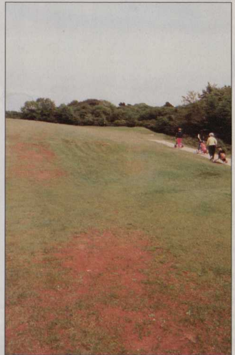
Right: A new tee position and a pathway from tee to green on the short 8th will give the turf time to recover during the summer months.

Winter course: 5574 yards, par 69. Four par 3's, 13 par 4's, one par 5.