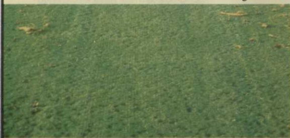
...Scarifies while mowing, or as a separate operation.