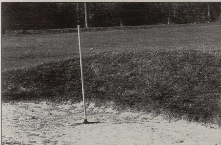
For grass banks, the 'big blow' works wonders