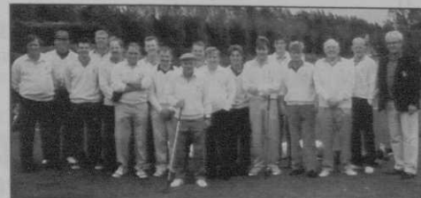
Northern Golf Team