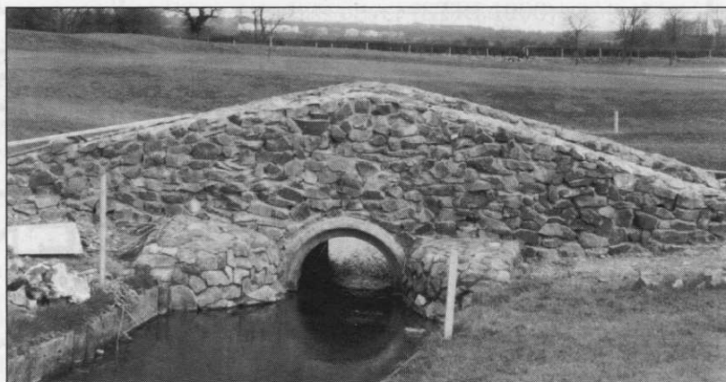
Bridge building at The Belfry.