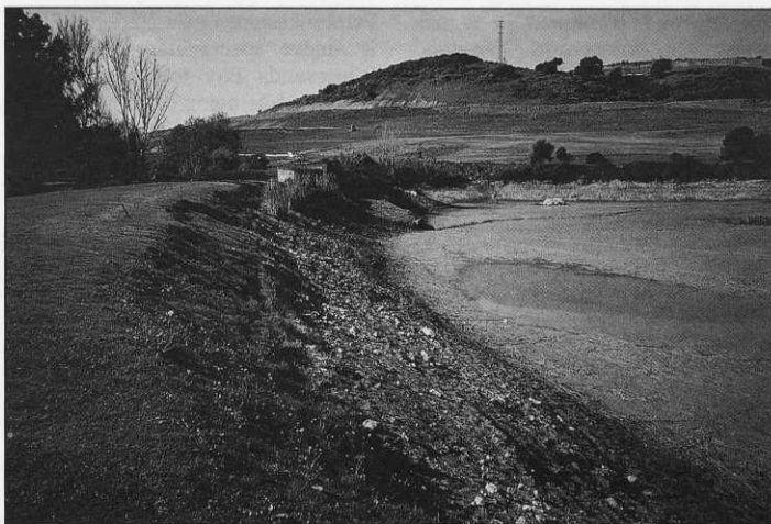
Winter storage reservoir drawn down at the end of the summer. Note unsightly view from adjacent tee

should for preference be situated off course, as inevitably they will become unsightly when draw-down, thus there is a requirement for additional land to be made available, which should be taken into account at the feasibility stage and subsequently at the