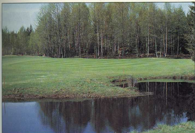
Ornamental lake - note grass to water's edge

approaches - would require something like an additional 1000 rounds of golf purely to meet the operating cost!