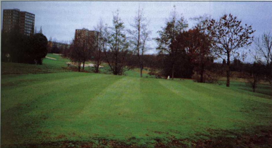
Above: A tee prior to Liquid Sod application at West Middlesex GC ...and the same tee nine days later

tractor, the most commonly used in this sector, and follows ground contours to give an even planting at a constant depth. Grass seed planted at a depth of 12mm has revealed an excellent rooting structure, which holds the sward together better than shallow planted seeds, which tend to be more easily scuffed off. The drill has a slitting action, thus moving the first inch or so of soil, relieving soil compaction and aerating the soil in a single pass, making conditions ideal for grass growth.