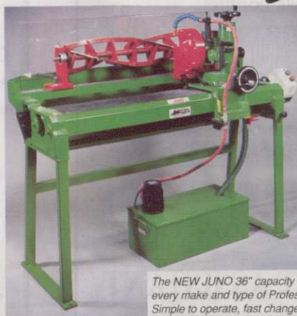
The NEW JUNO 36" capacity Cylinder and Bottom Blade Grinder will accommodate every make and type of Professional and Domestic cutting cylinders and soleplates. Simple to operate, fast changeover from cylinder to bottom blade grinding.

Quality engineering at its accurate best. Improve standards – cut costs