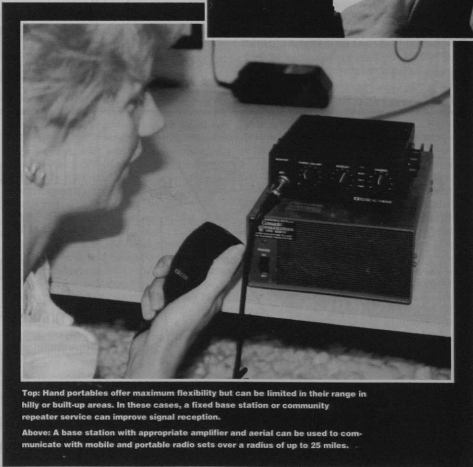
Top: Hand portables offer maximum flexibility but can be limited in their range in hilly or built-up areas. In these cases, a fixed base station or community repeater service can improve signal reception.

There are four principal frequency bands available to PMR users, each offering a different transmitting characteristic to suit the loca-