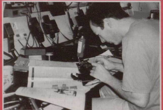
Mobile communications equipment will need servicing, repair and occasional retuning to the manufacturer's specifications. Ensure that your supplier has the facilities and expertise.

A further option which provides nationwide mobile radio coverage, yet is suitable also for those in cities where new frequency allocations are restricted, is National Band Three. Using a network of land lines and hilltop aerials, this service is used principally by distribution and haulage companies throughout Britain paying a monthly subscription per mobile set, with no call charges. National Band Three is available also with just