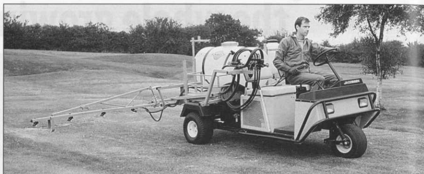
Hardi AM-PS de-mountable sprayer on a Jacobsen Workhorse

If there's one thing certain to upset the more senior members of the British population, it's an announcement about the introduction of more rules and regulations concerning another aspect of our daily lives. Whether emanating from Whitehall or Brussels, the arrival of yet more red tape is sure to make the blood boil and bring cries of 'molly coddling', 'wrapped in cotton wool' and 'never would have happened in my day', from the many who have more than solely an historical interest in the Second World War.