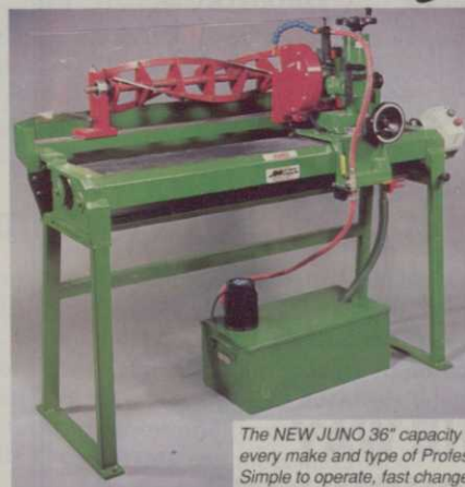
The NEW JUNO 36" capacity Cylinder and Bottom Blade Grinder will accommodate every make and type of Professional and Domestic cutting cylinders and soleplates. Simple to operate, fast changeover from cylinder to bottom blade grinding.

Quality engineering at its accurate best. Improve standards - cut costs