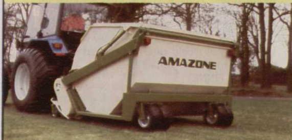
...Mows rough or fine.