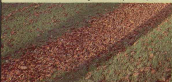
...Leaf and litter clearance - no problem!