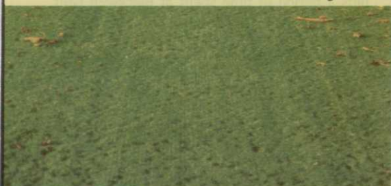
...Scarifies while mowing, or as a separate operation.