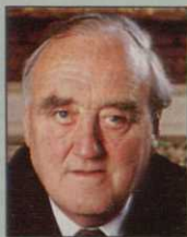
President The Rt. Hon. Viscount Whitelaw K.T., C.H., M.C., D.L.

Official publication of the British & International Golf Greenkeepers Association AUGUST 1993