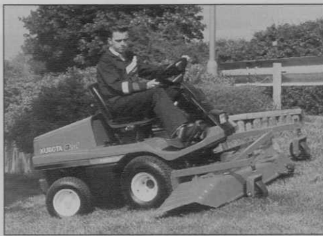
Kubota's 18hp F1900 ride-on front mounted mower

From their extensive machinery range Kubota are showing the complete B50 series of compact tractors, which comprises the 17hp B1550, the 20hp B2150 and the 24hp B2150.