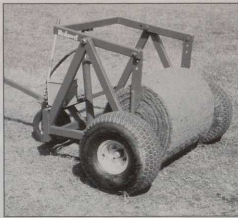
Rolawn's new Turfmaster laying machine

Rolawn (Turf Growers) Ltd (stand PSC1-10/11/12) will be showing its new and innovative 'Turfmaster' machine, which has been specially designed for use in places where, in the past, limited access has proven difficult for the greenkeeper to lay cultivated turf. Turfmaster is extremely versatile, manufactured in steel and measuring 5' 2" x 3' x 4' and weighing 260lbs. It incorporates a hydraulic control system for raising and lowering rolls and has a useful semi-automatic lowering device which can be used simultaneously when the laying