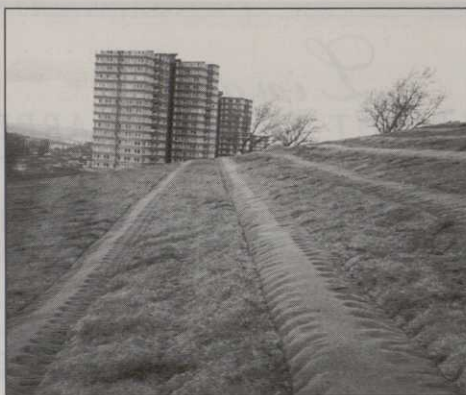
Vitax Wulch at a site in Sheffield prior to planting

New for IoG 1993 is Vitax Wulch, a 100% wool non-woven matting. Wulch is a totally new concept for landscape weed control using one of nature's oldest resources. Vitax Wulch biodegrades down over a one to two year period releasing nitrogen, sulphur, potassium