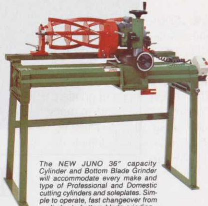
The NEW JUNO 36" capacity Cylinder and Bottom Blade Grinder will accommodate every make and type of Professional and Domestic cutting cylinders and soleplates. Simple to operate, fast changeover from cylinder to bottom blade grinding.