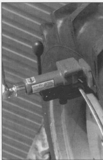
Up to 10 tonnes of pressure is produced by the Bead Buster to help remove tyres from rims without the use of hydraulics, pneumatics or very large sledge hammers