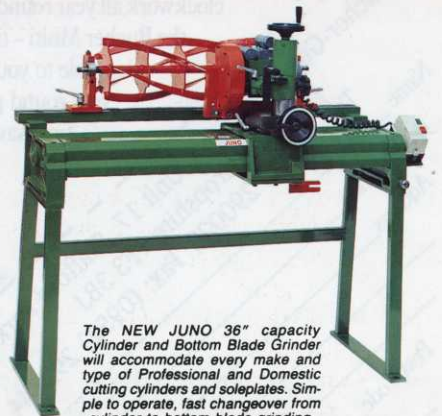
The NEW JUNO 36" capacity Cylinder and Bottom Blade Grinder will accommodate every make and type of Professional and Domestic cutting cylinders and soleplates. Simple to operate, fast changeover from cylinder to bottom blade grinding.