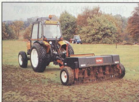
THE TORO FAIRWAY AERATOR