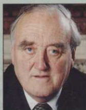
President The Rt. Hon. Viscount Whitelaw K.T., C.H., M.C., D.L.

Official publication of the British & International Golf Greenkeepers Association JUNE 1992