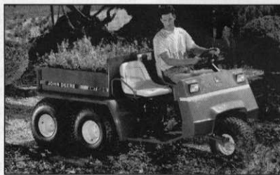
John Deere AMT 626

7 needed around a factory site, nor for moving from green to green – and many only have a single seat,